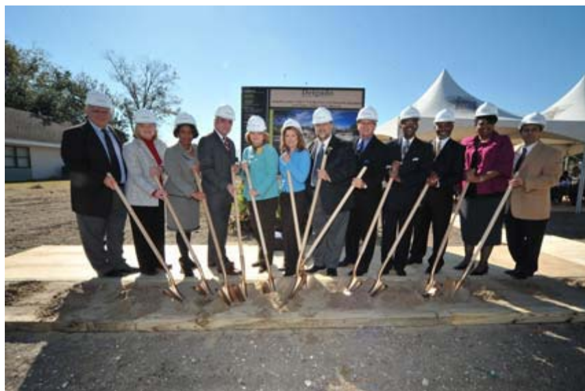
Ground breaking ceremony for the new Joseph James "Joey" Georgusis Center for Children

In addition, the center will serve as a "teaching facility" for Delgado and the community. It will provide a clinical setting for hands-on professional training of Delgado Care and Development of Young children program students, as well as a demonstration site for child care enrichment, in the community. The center will also assist in training and field experience for Delgado Psychology and Allied Health program students.