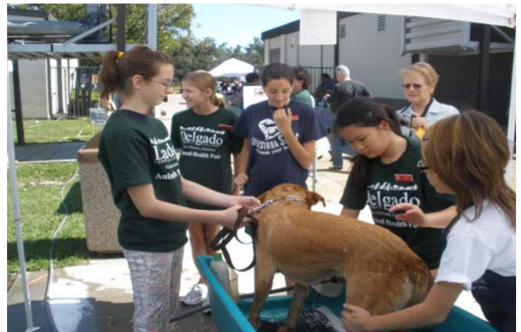
Members of the LA/SPCA Care Cadet program bathed over 100 dogs during the Animal Health Fair.