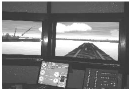
Delgado's Wheelhouse Proficiency Course utilizes our new Full Mission Bridge Simulator.

For more information call (985) 624-4165