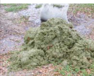
Above: A Cru volunteer skims duckweed and algae from the pond Left: Ready for mulch