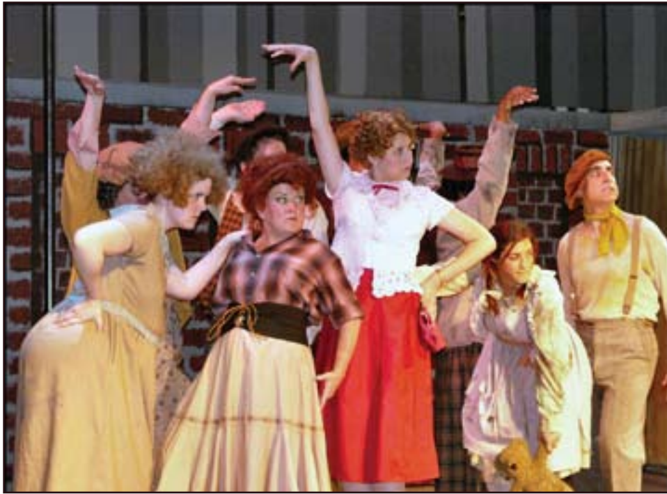
Delgado cast members of "Urinetown" sing about the "privilege to pee" in a world that sends those who refuse to pay for that privilege to a penal colony called "Urinetown." (Full cast photo at right.)